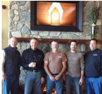
Home #1 - NH Log & Timber Homes, LLC