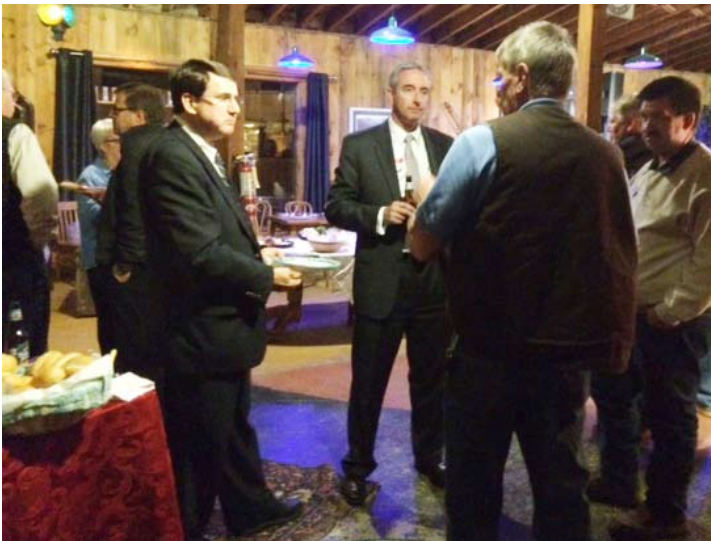
Social Hour and Networking