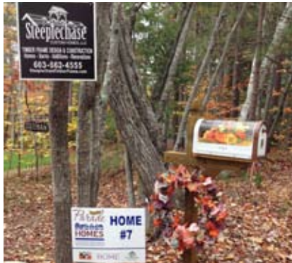
Home #7 Built by Steeplechase

Tuesday, February 10th, 2015 • 7:30 am • Location TBD PARADE OF HOMES Builders Round Table Breakfast Meeting