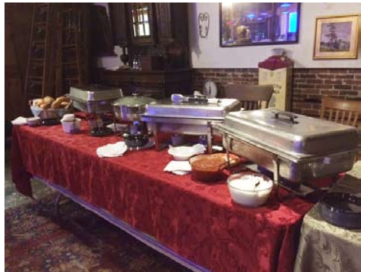
Annie's Catering provided a nice spread of food!