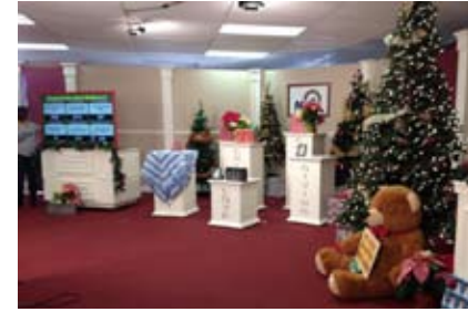
LRBRA Helped to Bring the Auction Set To Life! 2014 Total: $486,575!