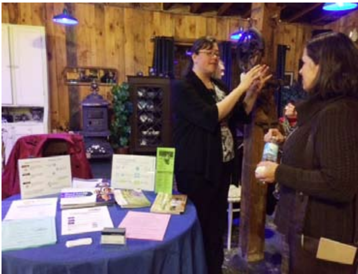
Thank you to LRGH for talking about open enrollment and the new health plans available.