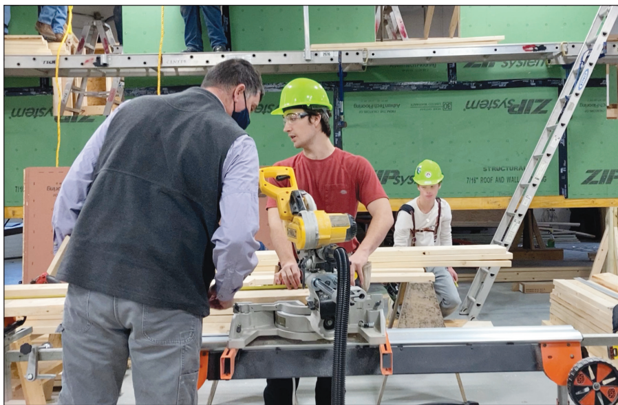
Builder helping students during Skills Learning Day.